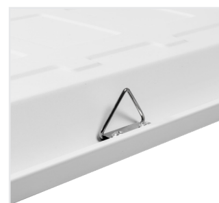
SEISMIC ANCHOR POINTS