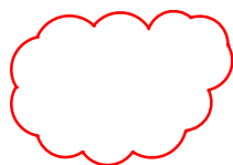
DETAIL A NBN SCHEMATIC NOT TO SCALE