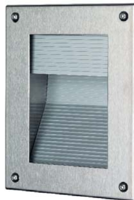
2744 with clear glass