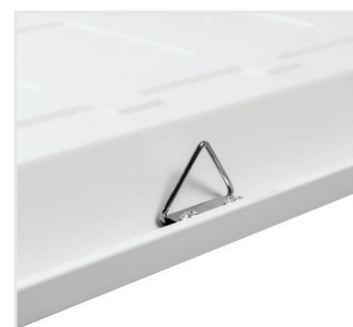
SEISMIC ANCHOR POINTS