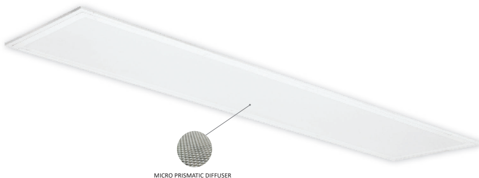
MICRO PRISMATIC DIFFUSER